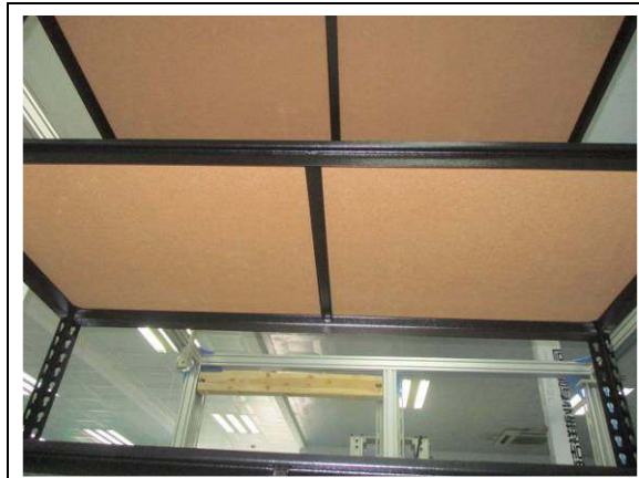
2 hours after removed the load -- Image 5